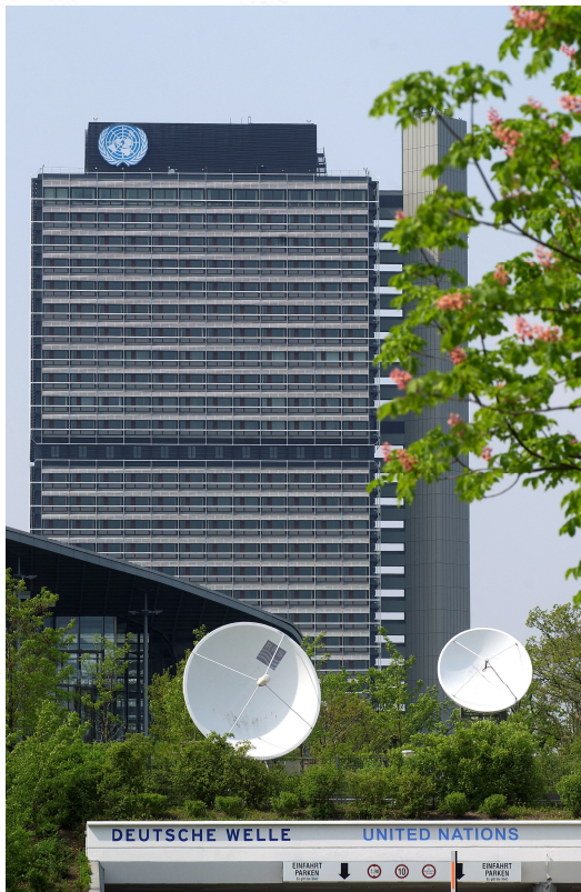
UN Bonn Campus

8. Endorses the recommendation of the Committee on the Peaceful Uses of Outer Space that the programme have an office in Beijing and an office in Bonn, Germany, and that the activities of the programme be carried out within the proposed implementation framework presented to the Committee;